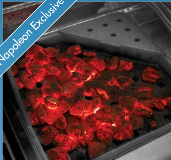
67731 – Charcoal Smoker Tray