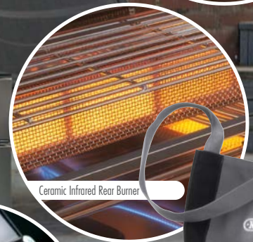
Ceramic Infrared Rear Burner