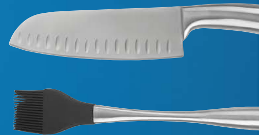
70012 – Professional 5 pce Tool set