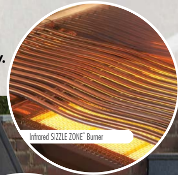
Infrared SIZZLE ZONE® Burner