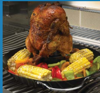
56020 – Wok & Beer Can Roaster