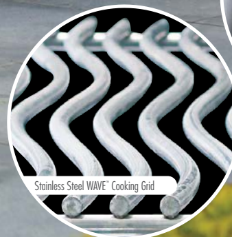
Stainless Steel WAVE® Cooking Grid