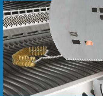
62011 – Brass Grill Brush