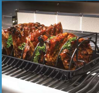
56011 – 3 in 1 Non-Stick Rib/Roast Rack