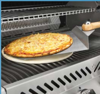
70003 – Pizza Spatula