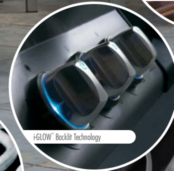
i-GLOW® Backlit Technology