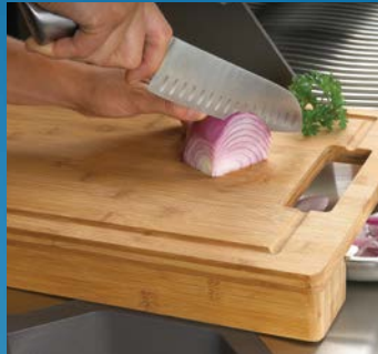
70012 – Professional Cutting Board