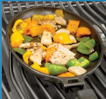
56003 – Cast Iron Skillet