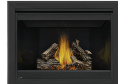
Premium 3" Bevelled Trim Kit