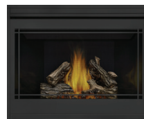
Contemporary Decorative Front