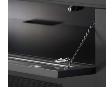
Convenient Compartment for Media Components