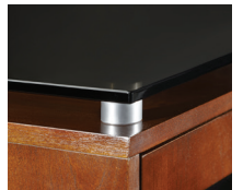
Smoke Tempered 10mm Glass Top