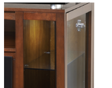
Glass Shelves with motion Sensor LED Lights