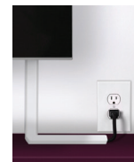
Paintable Cord Cover