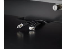
Wire Management System