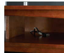
Convenient Compartment for Media Components with Wire Management System