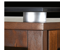
Brushed Aluminum Round Accent Posts