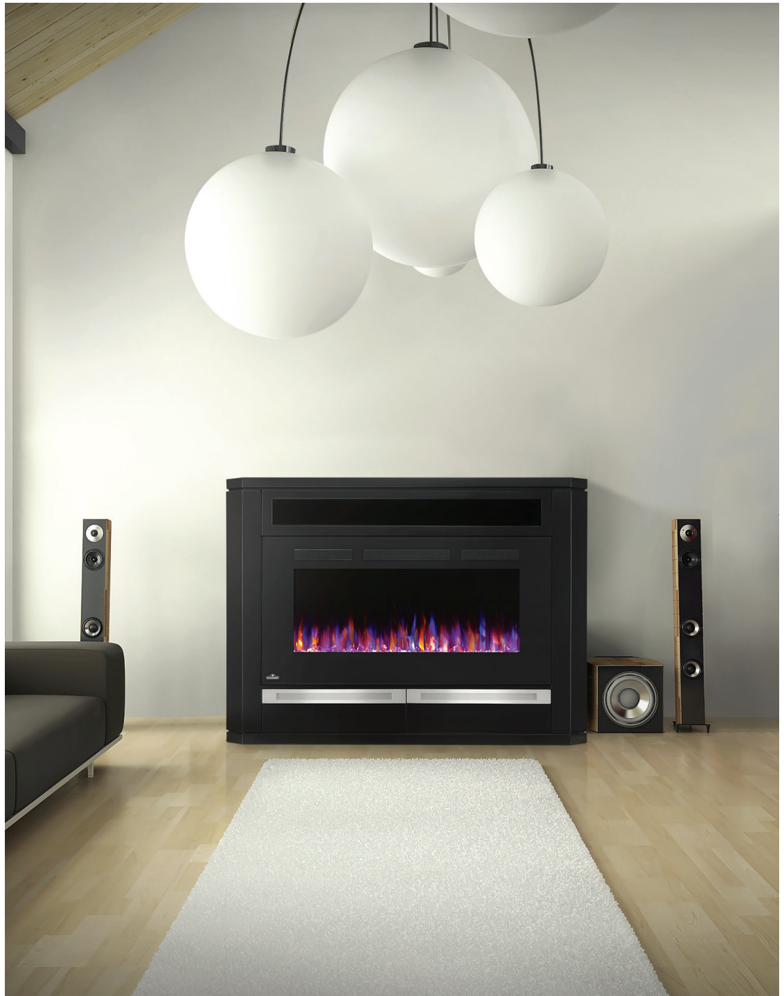
The Alanis Mantel Package