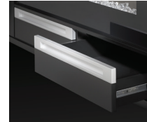
Silver Accented Drawers