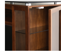
90 Degree Side Swing Doors