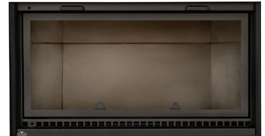
Smooth Decorative Brick Panels