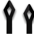
Steel Andirons in Charcoal Finish