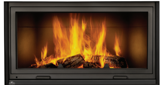
Screen Door Down and Smooth Decorative Brick Panels