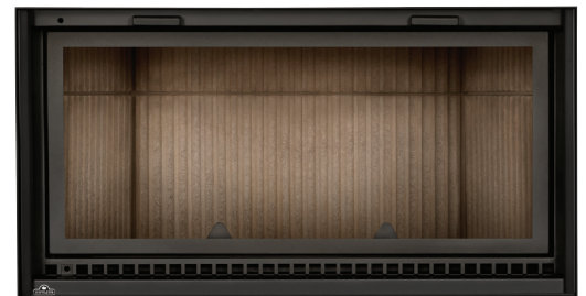
Fluted Decorative Brick Panels