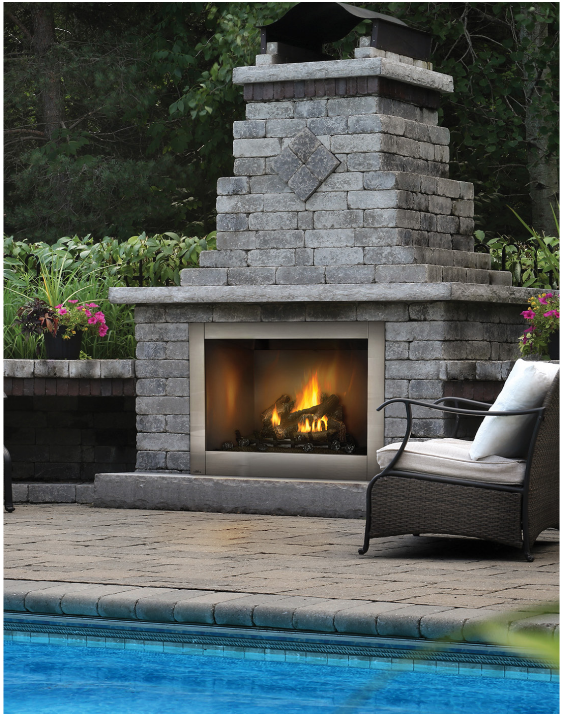
Riverside™ 42 Clean Face