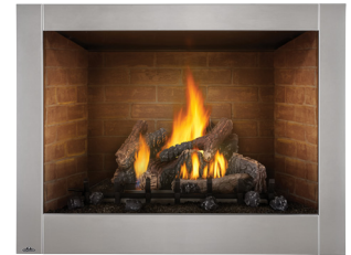
Decorative Sandstone Brick Panels