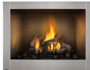
Riverside™ 42 Clean Face