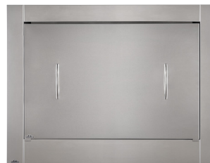
Optional Seasonal Protective Cover